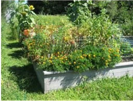
Raised Bed Example