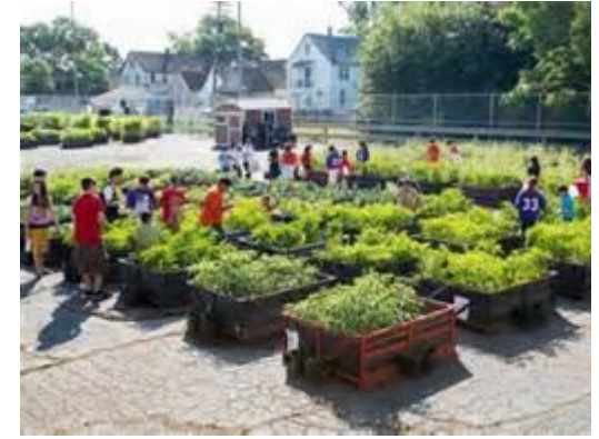
4 foot by 12 foot raised beds available

Town of Arlington Attn: Brittney Owens PO Box 507 5854 Airline Road Arlington, TN 38002